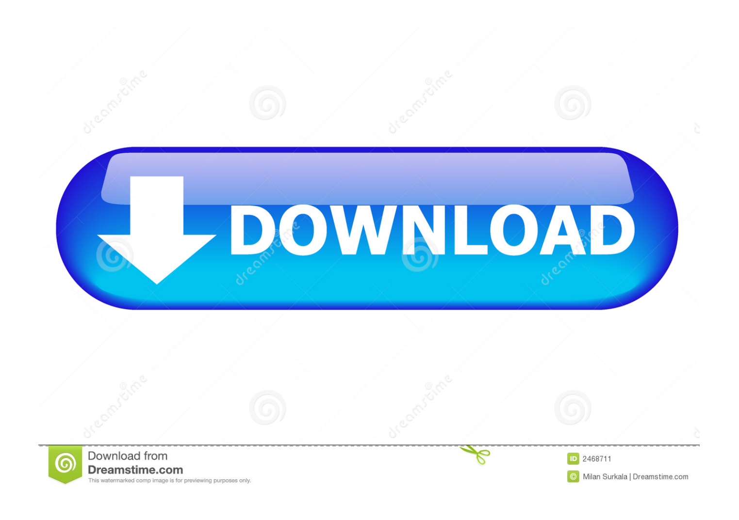
Serial Number Twitter Hack Pro